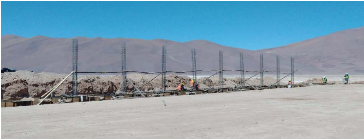
Figure 6. Rincon Lithium Project – 2,000tpa Operation Site Works (industrial plant constructions works)