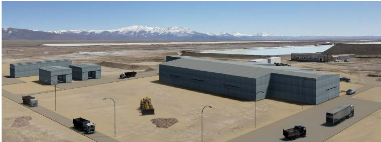
Figure 1. Rincon Lithium Project – 2,000tpa Operation Site Layout (schematic)

project development expansion. We look forward to a significant near-term growth phase from the increasing development activity at our Rincon Lithium Project.”