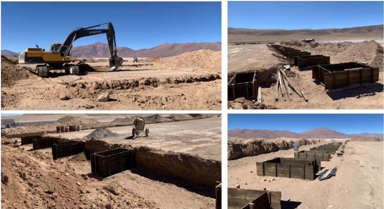
Figure 4. Rincon Lithium Project – 2,000tpa Operation Site Works (industrial plant constructions works)