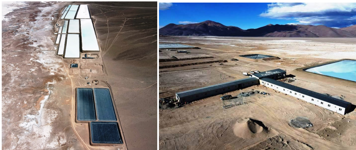
Figure 2. Rincon Lithium Project – 2,000tpa Operation Site Works

Coming works will focus on industrial plant construction works and plant equipment sourcing. Site works are considerably increasing, with major progress and significant advancement to be made over coming months.