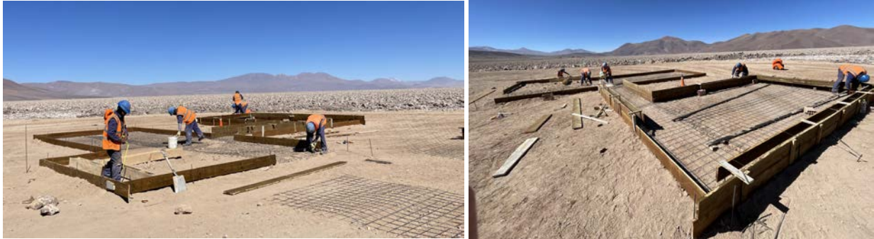
Figure 3. Rincon Lithium Project – 2,000tpa Operation Site Works (industrial plant constructions works)