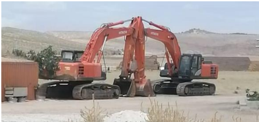
Figure 2: two TMS excavators located in Tajerouine seized by Celamin in September.

These legal measures include investigations into TMS actions to avoid an adverse arbitration outcome and date back to the commencement of the dispute in early 2015. As announced on 31 August 2020, these investigations have resulted in the seizure of trucks, cars, loaders and other mining equipment. Celamin's legal team has also seized two excavators located in Tajerouine, Tunisia (see figure 2 below). These machines cannot be accessed by TMS at this time and, subject to determining ownership, may be sold with funds going to Celamin to offset the damages and costs owed by TMS.